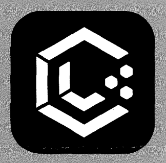
Lume Cube App

Follow these steps below to operate your new Lume Cube Panel Pro